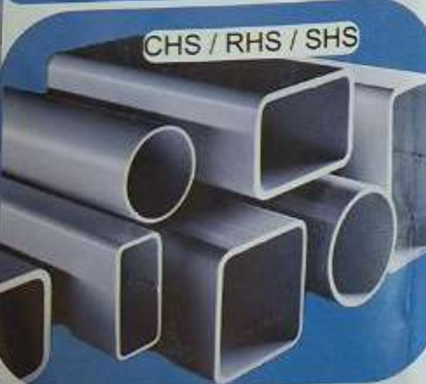
CHS / RHS / SHS